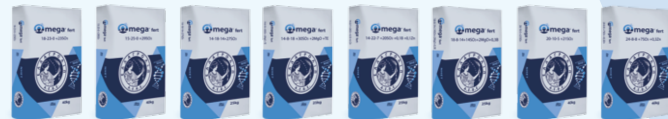
Omega® fert 18-23-0 (+23) Omega® fert 15-25-0 (+29) Omega® fert 14-18-14 (+27) Omega® fert 14-8-18 (+30) +2MgO+TE Omega® fert 14-22-7 (+20) +0,18+0,1Zn Omega® fert 18-8-14 (+14) +2MgO+0,38 Omega® fert 20-10-5 (+21) Omega® fert 24-8-8 (+7) +0,3Zn